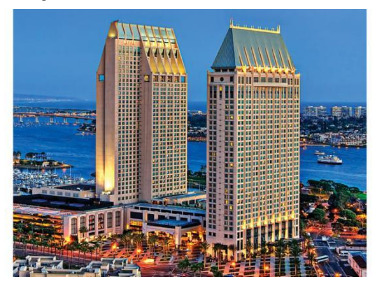
Manchester Grand Hyatt San Diego

Make plans now to attend the International System Safety Conference at the Manchester Grand Hyatt in San Diego, California, August 24-28, 2015.